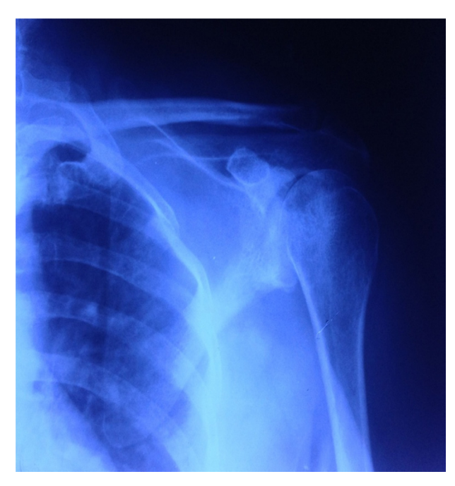
Fig. 1. Radiograph of right shoulder showing superior migration, decreased joint space and degenerative changes in the humeral head.

P.K. Gupta et al./Journal of Clinical Orthopaedics and Trauma xxx (2016) xxx-xxx