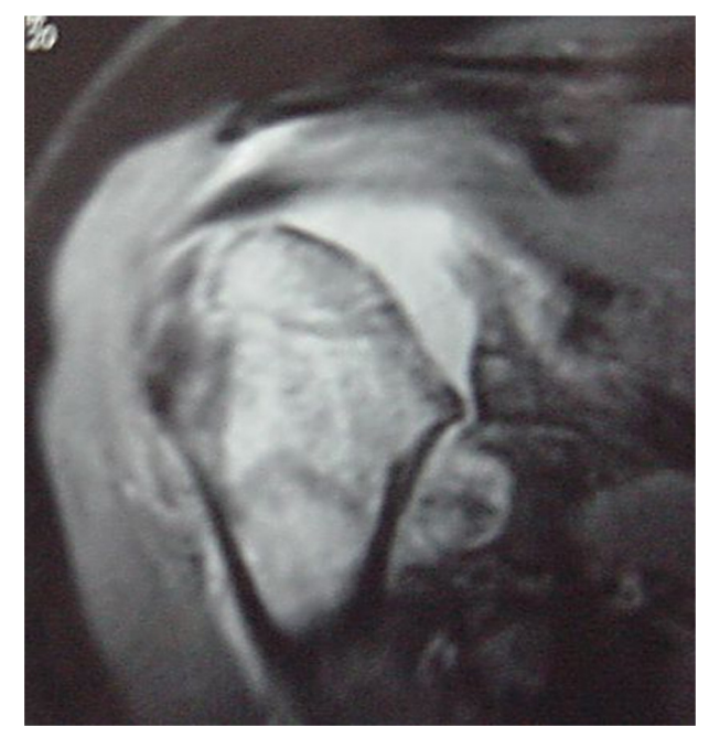
Fig. 2. MRI of the right shoulder demonstrated joint effusion, synovial thickening, articular erosion and flattening of the humeral head possibly because of chronic inflammatory/infective process with degenerative changes.

Based on arthroscopic findings, provisional diagnosis of alkaptonuria was thought and patient re-evaluated in light of