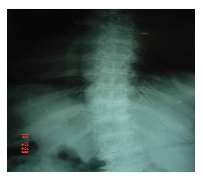
Fig. 5. Radiograph of dorsal and lumbar spine showing narrowed disc spaces with wafer like horizontal bands of calcification of each space.

(Fig. 6). Her urine turned dark on long exposure to air. Her mother also had similar symptoms of multiple joint pains. Darkening of urine was also noted in other members of family.