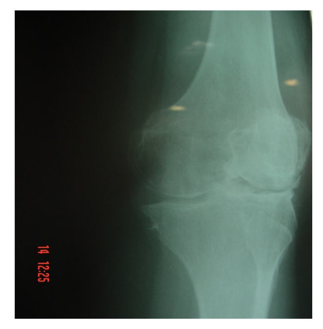
Fig. 6. Radiograph of knee joint showing diminishing of joint spaces.

Histopathologic examination of the synovial tissue showed nonspecific inflammation with focal coarse brown-black pigmentation which was negative for Iron stain (Fig. 7). Urine examination showed presence of HGA, thus confirmed the diagnosis of alkaptonuria.