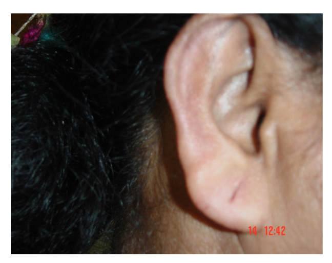
Fig. 4. Auricular cartilage showing bluish discoloration.